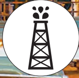
NATURAL GAS PRODUCTION AND PROCESSING