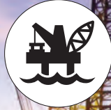
OIL PRODUCTION AND PROCESSING