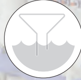
CHEMICAL PETROCHEMICAL PLANTS