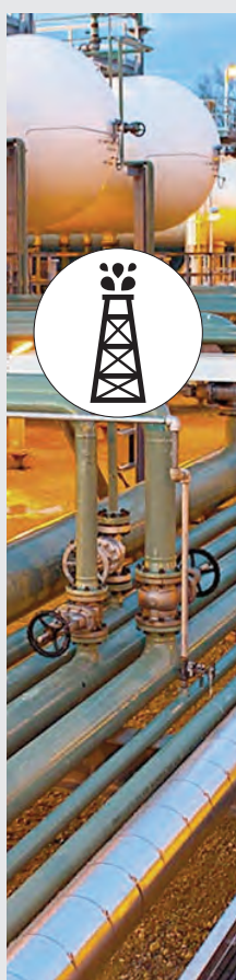
NATURAL GAS PRODUCTION AND PROCESSING